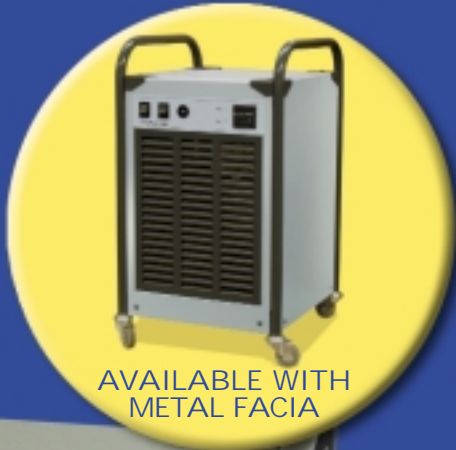
AVAILABLE WITH METAL FACIA