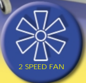
2 SPEED FAN